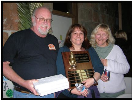
2011 Winners: The Mysterians